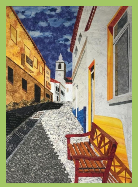
Bobbie Sullivan, High Noon, Lagos, Portugal , 34 x 24