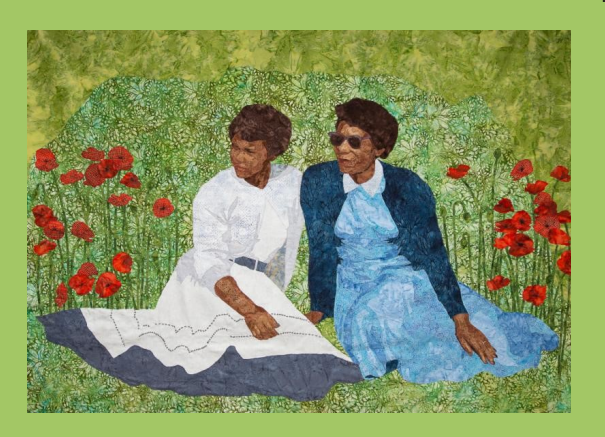
Maggie Dillon, Poppy Picnic, 42 x 59 in.

The WHMA welcomed contemporary quilts of all kinds, colors, and subject under the theme of Fiber Fusions , allowing all fiber artists to showcase their strongest work. As with all art; composition, color, and design are important towards the creation of a finished work of art. In this exquisite exhibition, fiber and other materials fuse together, through the integration of creative skills and imagination, presenting the artistic expression of each individual art quilter.